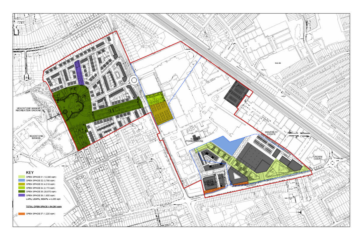
The table below sets out the quantum of each of these areas: