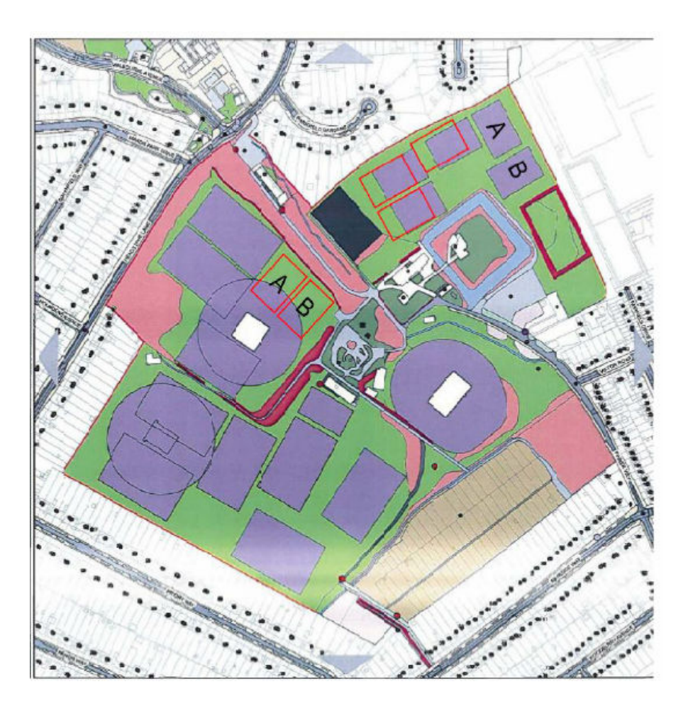
5.20) The applicants submission set out how through S.106 payments arising from the development improvements to the quality and carrying capacity of all pitches at Headstone Manor, by relocating and upgrading the mini soccer pitches (as shown on the above diagram) to accommodate a reed bed drainage scheme, installing pipe drains with sand groove systems to pitches and improving/extending changing accommodation could be achieved. There would be no loss or gain of pitches on the site in terms of quantum, but the collective carrying capacity of the mini-soccer pitches would increase from 7 hours per week at present to 25 hours per week.

clubhouse), Bessborough Cricket Club (fields 4 adult and 1 colts team) and West Harrow Cricket Club (fields 3 adult and 4 colts teams and has a clubhouse at the west end of the site).